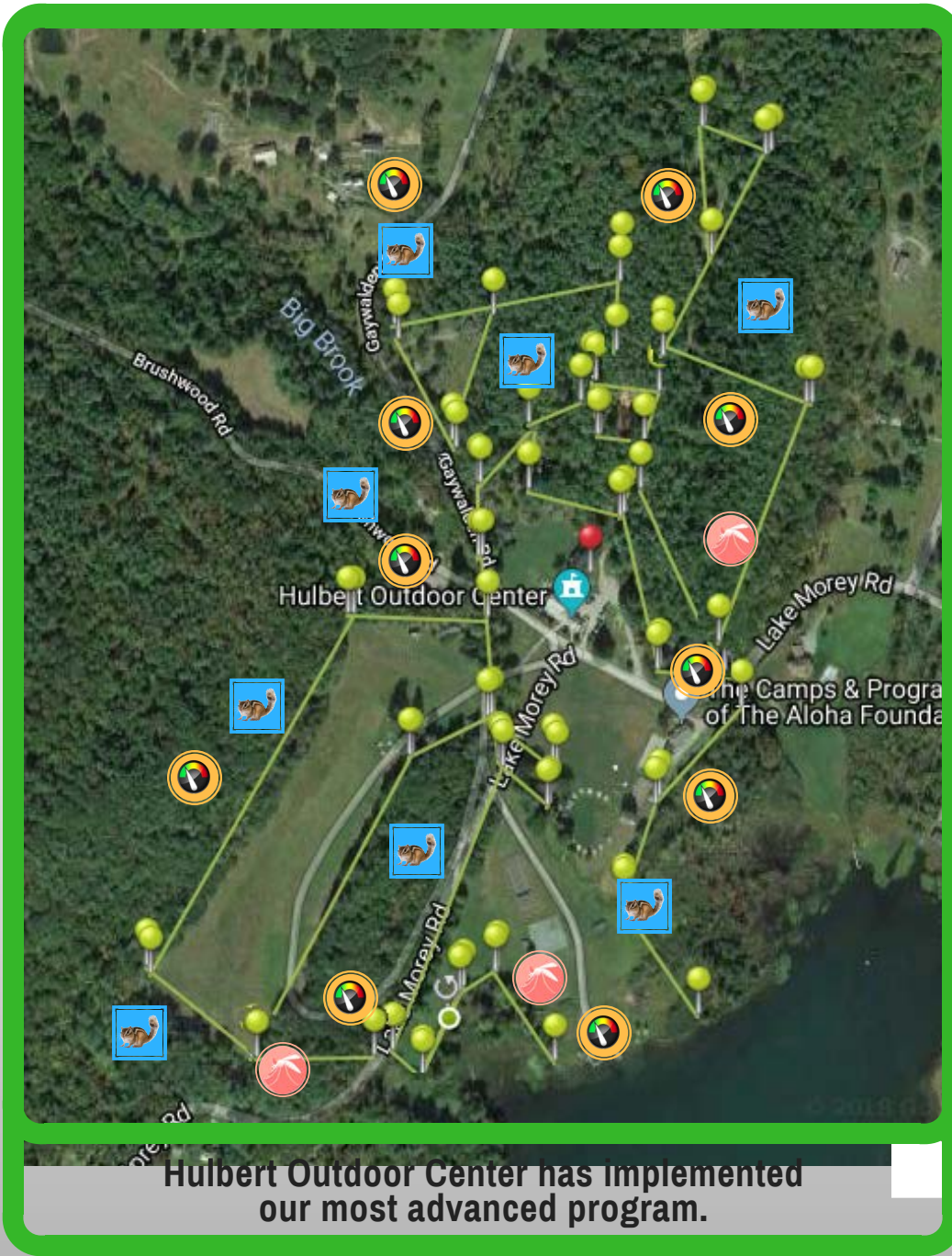
Hulbert Outdoor Center has implemented our most advanced program.